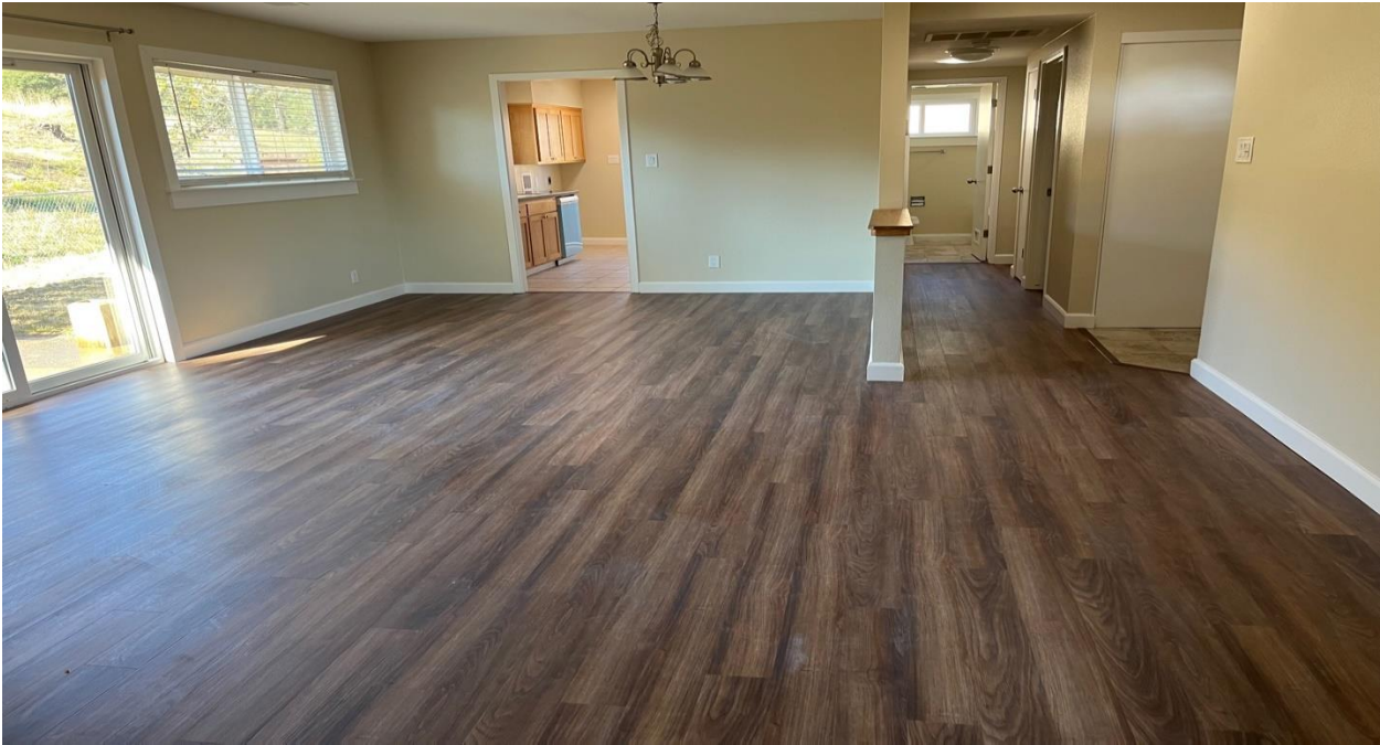
LIVING ROOM VIEW