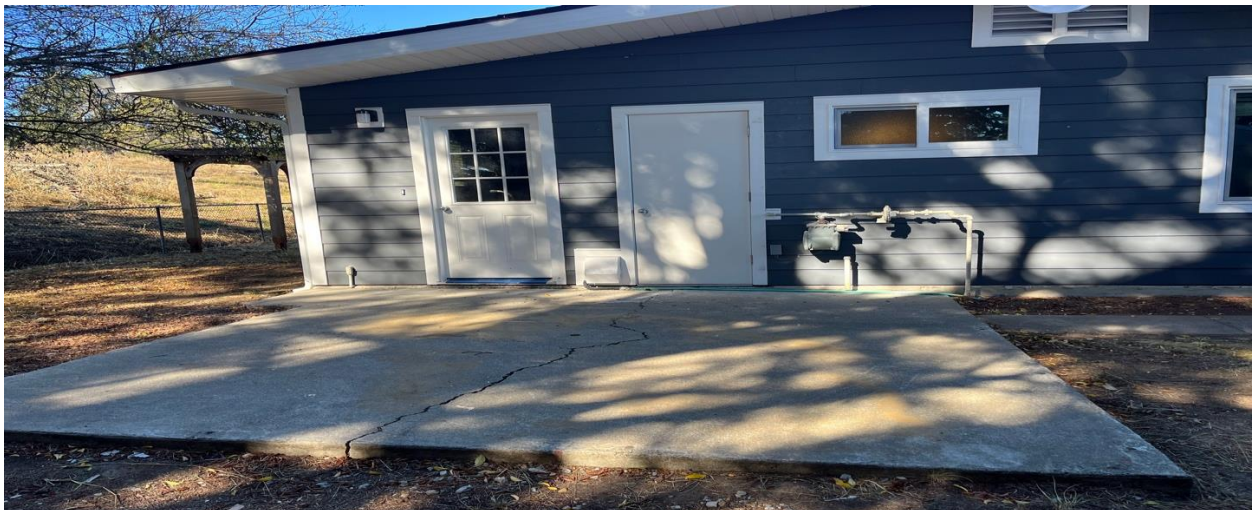
BACK ENTRANCE VIEW