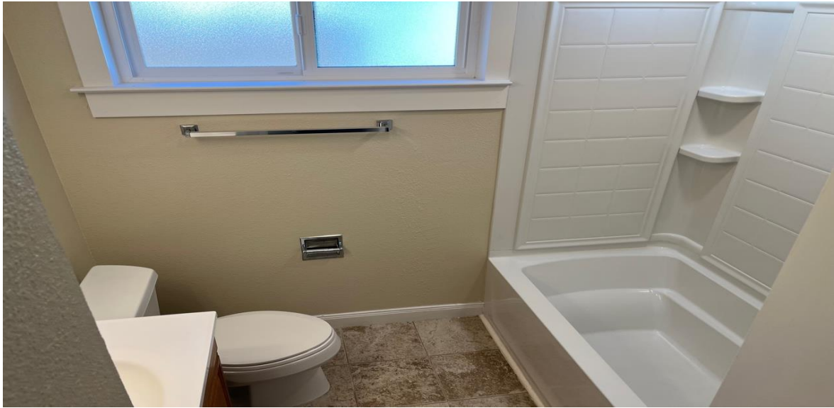
BATHROOM # 1 VIEW