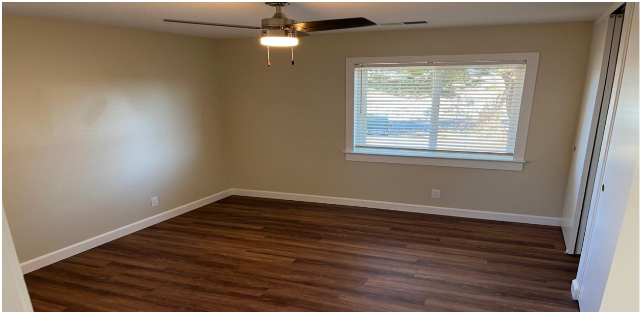
BEDROOM NUMBER ONE