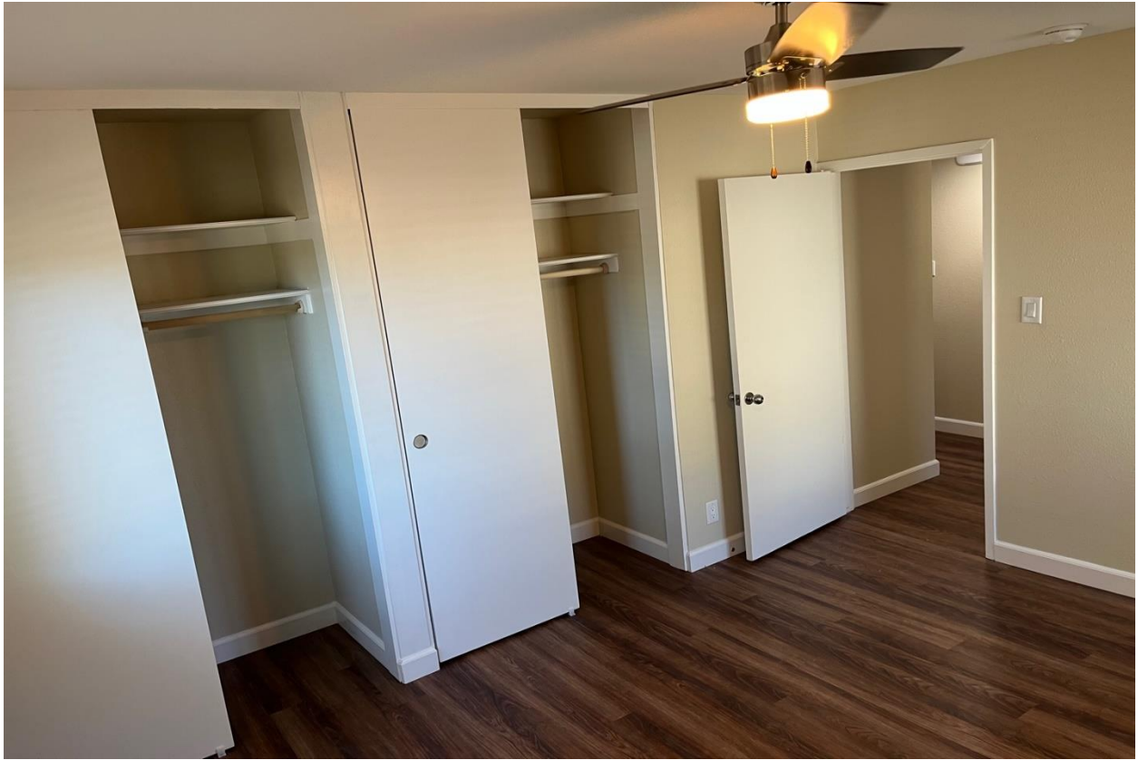
BEDROOM NUMBER ONE DIFFERENT ANGLE