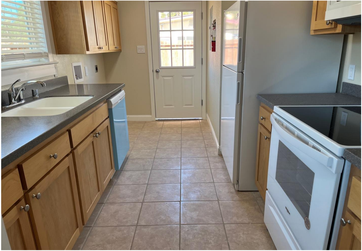
KITCHEN & LAUNDRY AREA VIEW